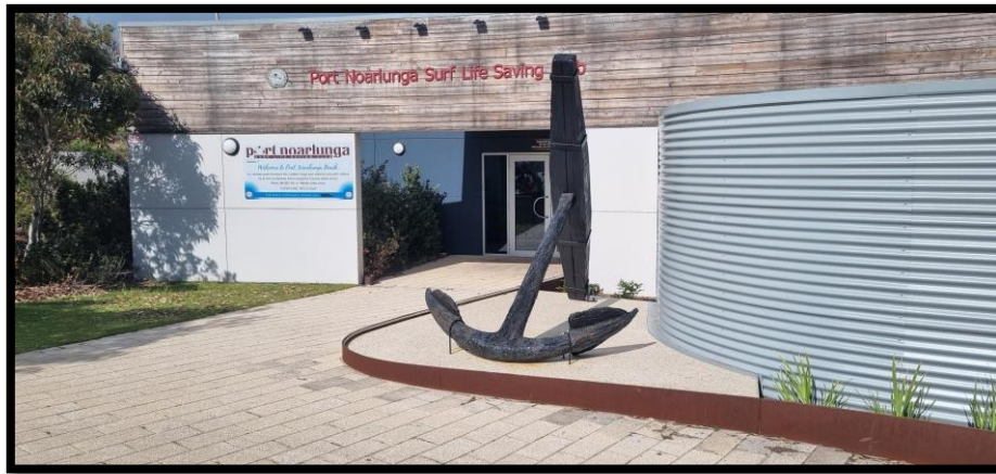
Sea Wolves Anchor Unveiling 1 March, Port Noarlunga