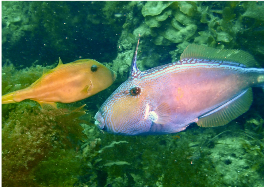
Leatherjackets reappearing at Mac's Ground, 15 March 2026.